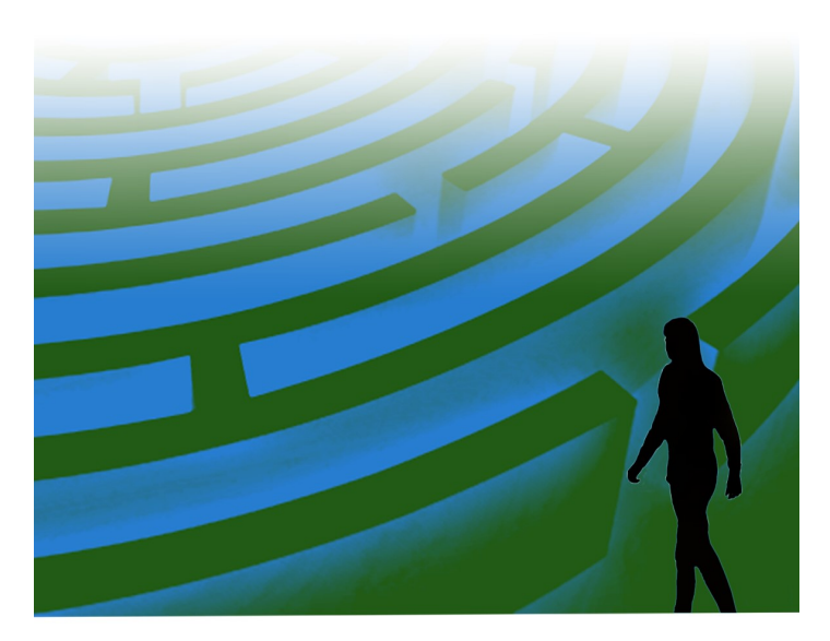
LEGISLATIVE COUNCIL SERVICE DECEMBER 2024